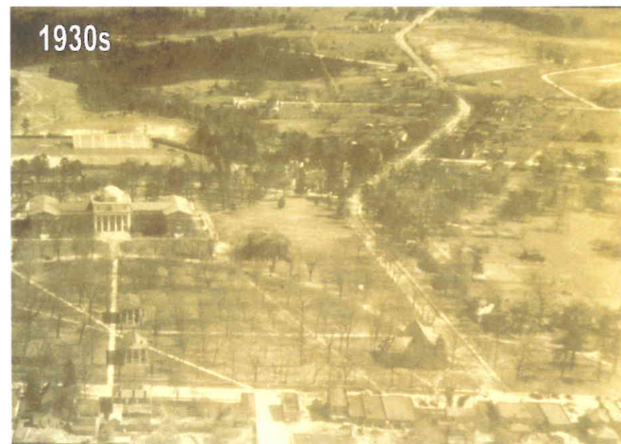
Historic Town Aerial 1933.

Unfortunately, Davidson has not been insulated in recent decades from negative side effects of rapid regional growth, and development decisions in the past have not continued the historic interconnected street pattern.